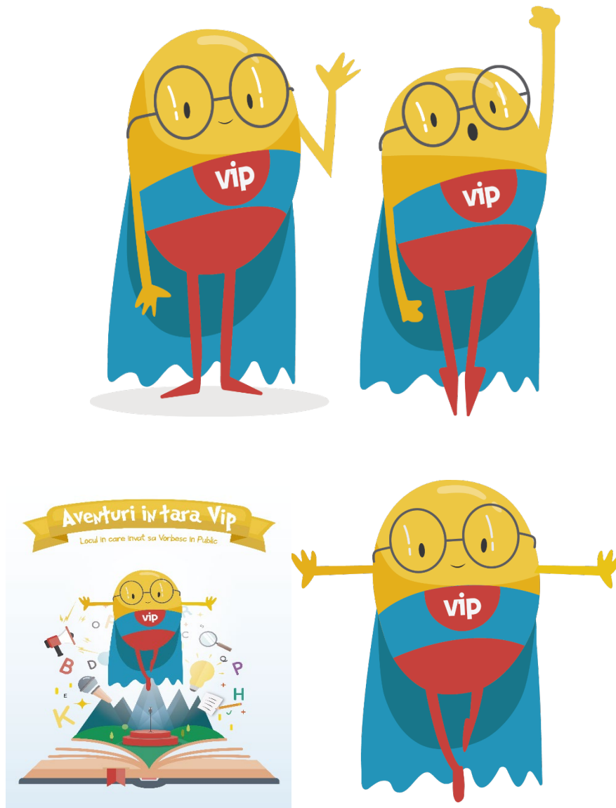
Figure 7: Developed materials 2

fonts are Futura book for text, Grinched for title and Jingle bells for cover. The concept and the movements of the mascot were created on the round structure.