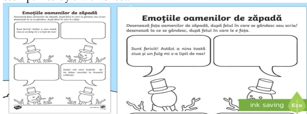
Figure 1: Verbal message accompanied by a worksheet

The first category of receivers, the children in the public schools, had mastered the theoretical level of a set of information about feelings. The second category experienced feelings with the help of the senses. The method of delivery for the first category was the verbal message accompanied by a worksheet.