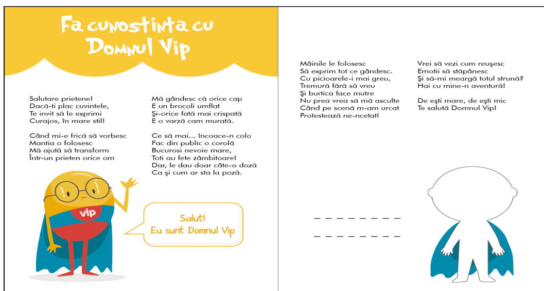
Figure 8: Developed materials 3

The created materials are intended to capture and maintain the children's attention, the interaction with them but also to understand the message sent in a dynamic and contemporary way.