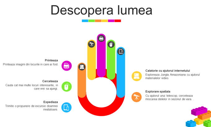
Figure 4: Slideshow 1

When the sender turns to a media support for the presentation, s/he usually uses PowerPoint, Prezi, or Keynote. But no matter what programme s/he uses, there are some general rules that must be applied in order to have a good material.