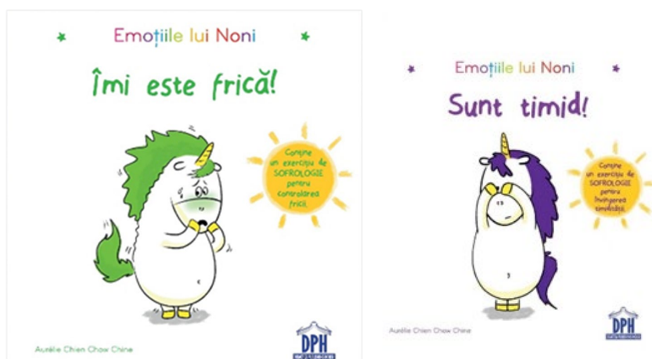
Figure 3: Noni's feelings

Depending on the children's age, when delivering the public speech, nicely-coloured materials in the shape of a book or a brochure, being represented by a funny character or a nice mascot, are recommended. In this case, "Noni's feelings" book series was used, the main character being a unicorn that experiences different states that can be presented to the children. The graphics are very modern, printed in an A6 format, so that they could be easily handled by the children.