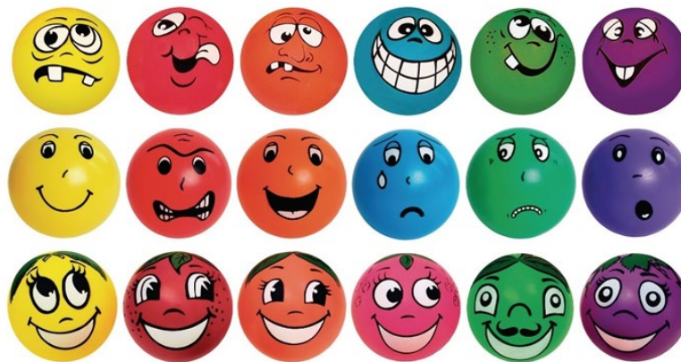
Figure 2: Coloured balls

example. A situation with many perspectives, allowing questions and a complex approach of a subject. The following steps are recommended: building a cube that has the following words written on the sides: describe, compare, analyse, associate, apply, and argue. This method helps both the receiver and the sender. In this example, the cube was accompanied by coloured balls that represent the basic feelings. Every receiver received a ball that represented a feeling and then proceeded to analyse it with the cube as homework.